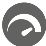
5750 high rpm