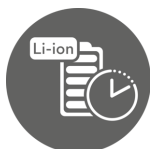
1h20 charge | 1h45 use